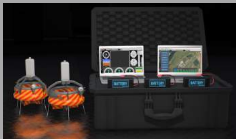
READY TO DEPLOY